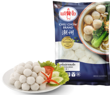
Frozen Fish Ball (Medium) CHIU CHOW

200g x 20 200g x 50 500g x 20 1000g x 10