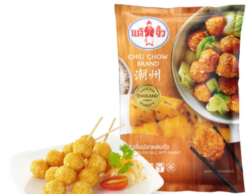
Frozen Fish Ball with Shrimp CHIU CHOW

200g x 20 200g x 50 500g x 20 1000g x 10