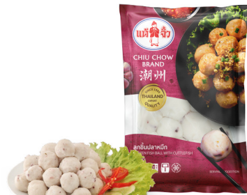
Frozen Fish Ball with Cuttle fish CHIU CHOW

200g x 20 200g x 50 500g x 20 1000g x 10