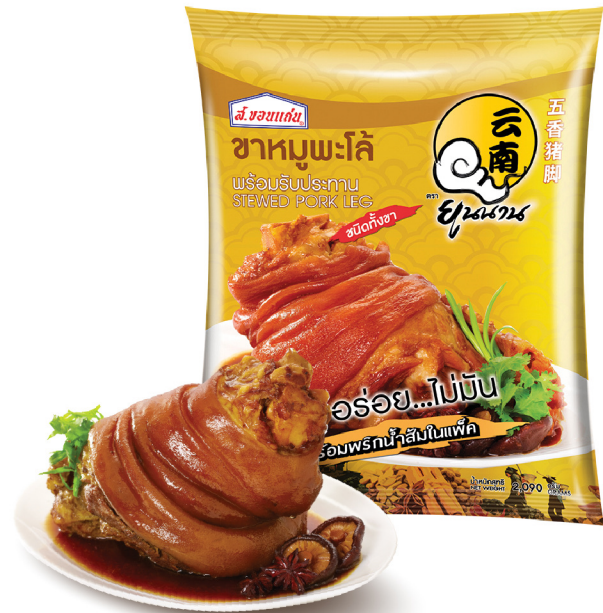
Stewed Pork Leg YUNNAN BRAND