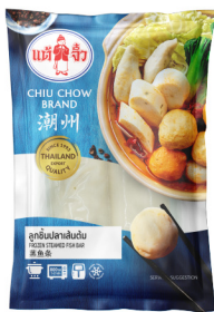
Frozen Steamed Fish Bar CHIU CHOW

200g x 20 200g x 50 500g x 20 1000g x 10