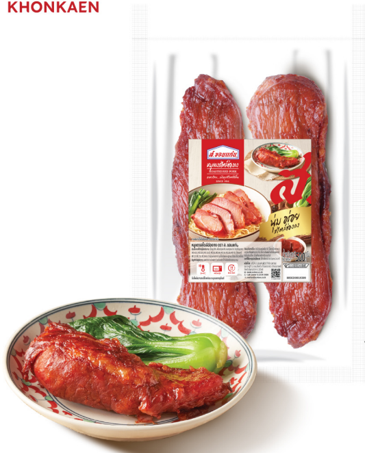
Roasted Red Pork SOR KHONKAEN