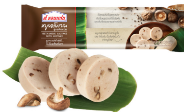
Sliced Spicy Vietnamese Sausage SOR KHONKAEN