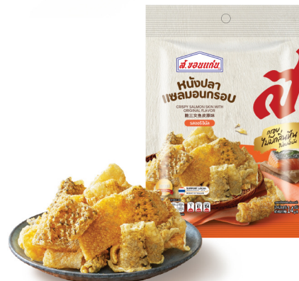
Crispy Salmon Skin with Original Flavor SOR KHONKAEN