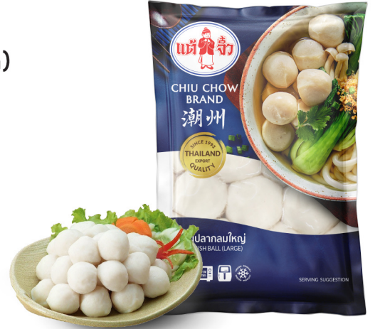
Frozen Fish Ball (Large) CHIU CHOW

200g x 20 200g x 50 500g x 20 1000g x 10