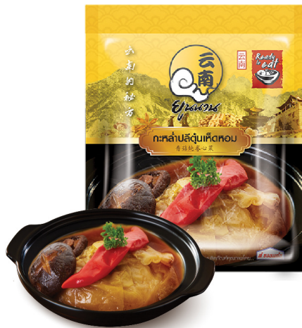
Stewed Cabbage with Shiitake YUNNAN BRAND