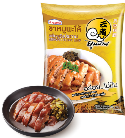
Stewed Pork Leg YUNNAN BRAND