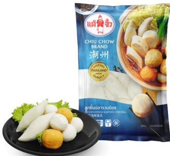
Frozen Mixed Seafood Fish Ball CHIU CHOW

200g x 20 200g x 50 500g x 20 1000g x 10