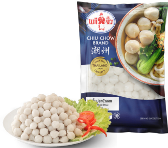
Frozen Fish Ball (Small) CHIU CHOW

200g x 20 200g x 50 500g x 20 1000g x 10