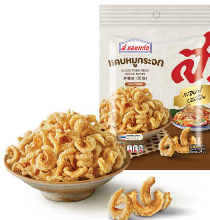
Sliced Pork Rinds Origin Recipe SOR KHONKAEN