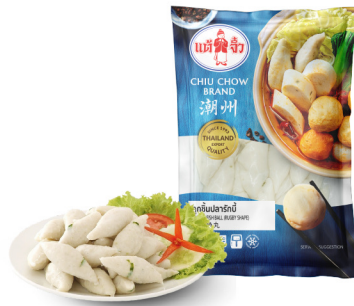
Frozen Fish Ball with Vegetable (Rugby Shape) CHIU CHOW

200g x 20 200g x 50 500g x 20 1000g x 10