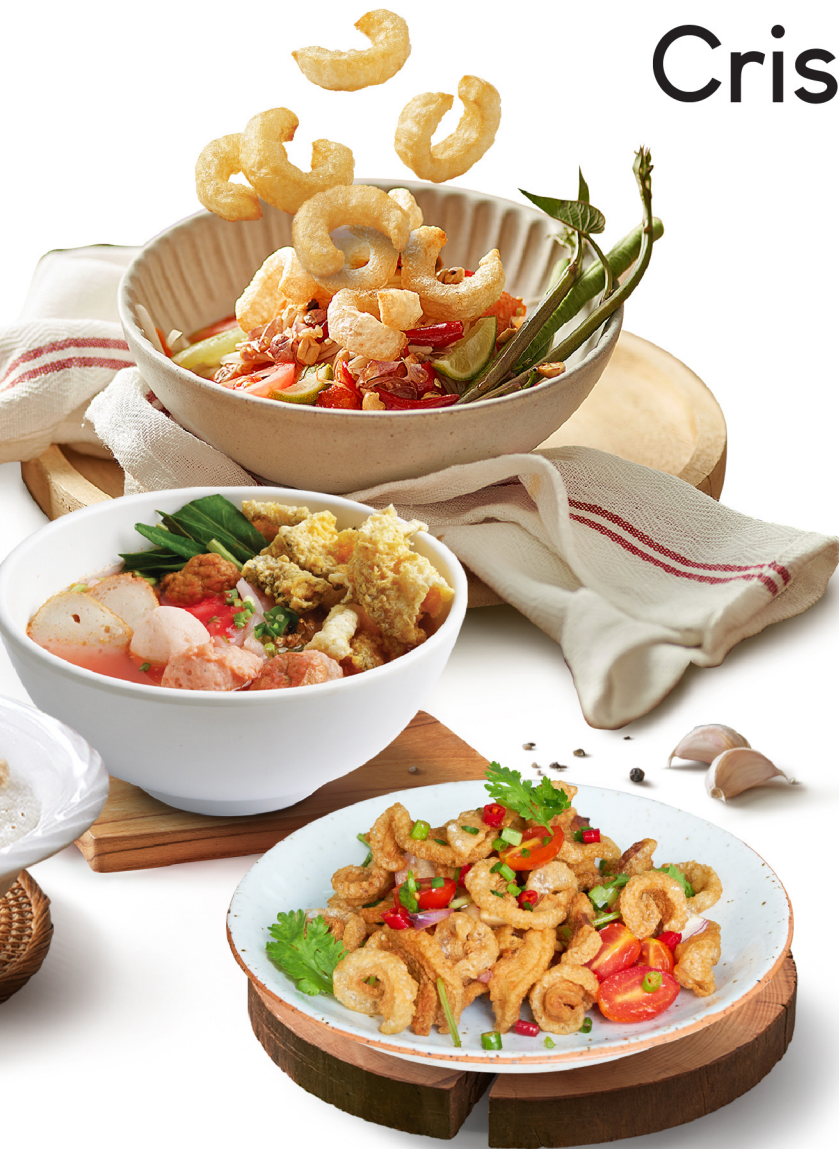
Crispy Pork Rinds SOR KHONKAEN