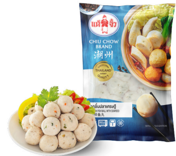
Frozen Fish Ball with Seaweed CHIU CHOW

200g x 20 200g x 50 500g x 20 1000g x 10