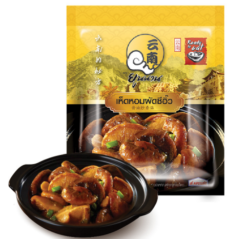
Stir-Fried Shiitake with Soy Sauce YUNNAN BRAND